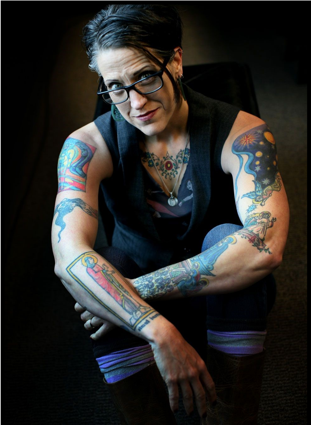
Pastor Nadia Bolz-Weber